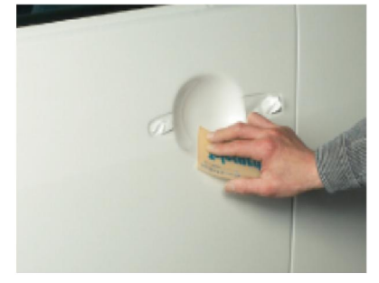
Flat surface with Toleblock S