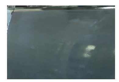
f) Ready to polish surface completed. © 2017 Kovax Corporation